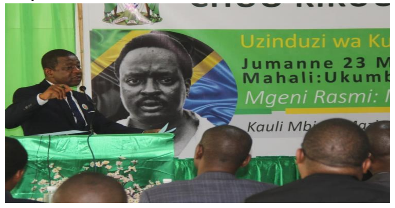
Photo 2: Hon. Abdallah Hamis Ulega (MP) delivering a launching speech of the Sokoine Memorial Week on 23<sup>rd</sup> May, 2023 at SUA, Morogoro

During the launching speech (Photo 2), the guest of honour commended the SUA Management for the successful Commemoration.