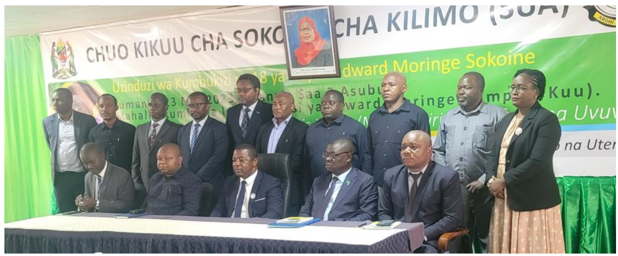
Photo 16: Institutions under the Ministry of Livestock and Fisheries that signed the MoU with SUA on 23<sup>rd</sup> May, 2023

Given the Tanzanian government's agenda on industrialization, Sokoine University of Agriculture (SUA) has a great potential of contributing towards the achievement of this agenda by working with the industry to develop new innovative (indigenous) technologies that are better-suited to our country's conditions, and which may reduce the need for importing ill-suited and technologies. In addition, the linkage with industry is likely to make the training offered at SUA more practical-oriented and demand driven by providing students and junior staff the opportunity to conduct practical hands-on learning, research and outreach with the industry.