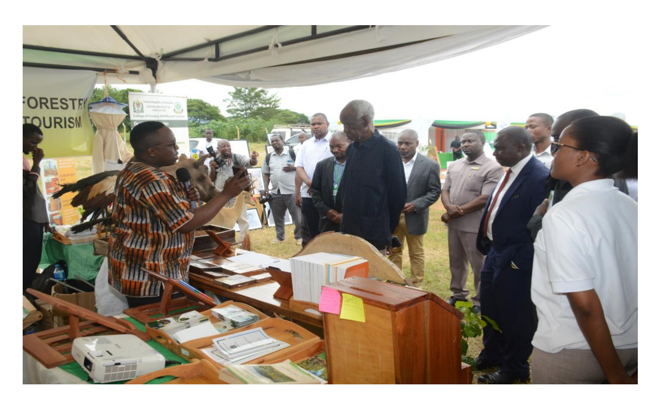
Photo 11: Hon. Judge Joseph Sinde Warioba (Retired), the Chancellor of SUA, touring at the booth of the College of Forestry, Wildlife and Tourism on 24th May, 2023 at SUA, Morogoro