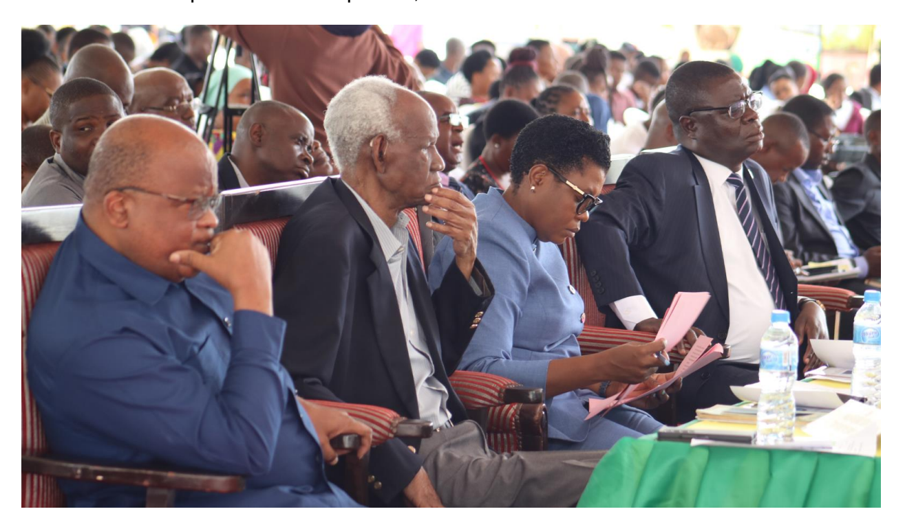
Photo 14: Participants attentively listening to the keynote speakers of the high profile panel discussion on 26<sup>th</sup> May, 2023 at SUA, Morogoro

and other stakeholders. There were four keynote speakers shown in Table 7 selected based on their experience and expertise, whose role was to stimulate the discussion.